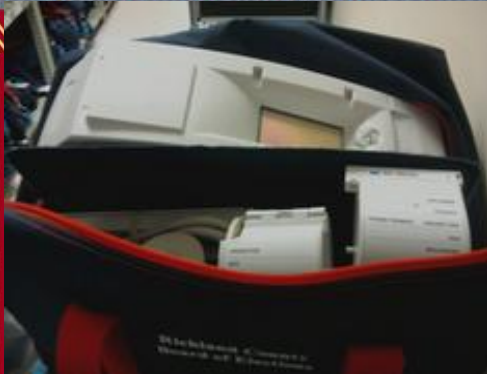
Re-Pack Printer Bags to ensure adequate protection of the housing unit and components in transport.