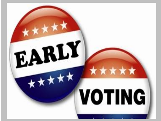
HB 194 will not be in effect for the November 8, 2011 General Election